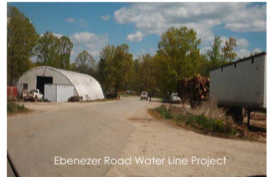
Ebenezer Road Water Line Project